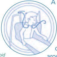
Avoid strangulation hazards

A protrusion hazard is a component or piece of hardware that is capable of impaling or cutting a child, if a child should fall against the hazard.